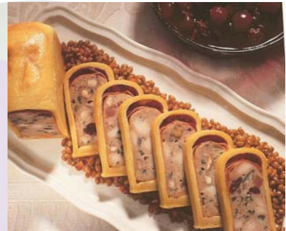
Turkey Pâté en Croûte

Our roulades are formed from a larger cut of meat, such as pork tenderloin, encased in pâté and often rolled in spices or herbs. They are also served chilled and sliced.