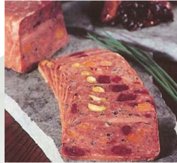
Duck Terrine with Pistachios and Dried Cherries

Our terrines often have various ingredients add to them as a garnish to give them texture and visual appeal. Garnishes include chunks of meat such as ham, dried fruit such as cherries or nuts. They can be easily sliced and are served cold.